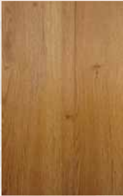
Green Mountain Oak 147414