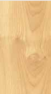
Appalachian Pine 146956