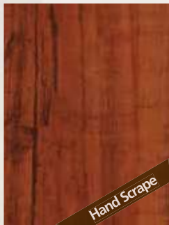
Shipyards Distressed Mahogany 147045