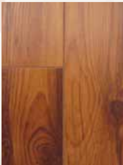
Barnside Plank 147223